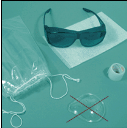
TE-671Y Super Economy